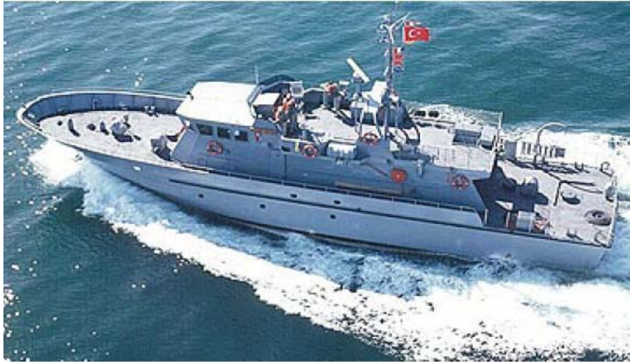
Eight of the above patrol boats build for Middle East Client