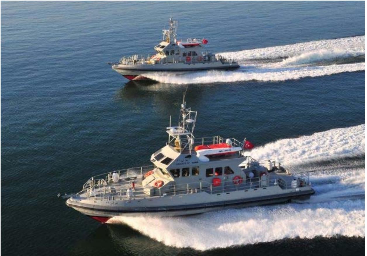
Patrol Boats for Turkey