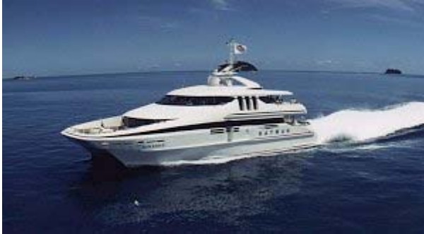
29m Luxury Catamaran

Our larger power yachts feature all the typical characteristics of our other designs; they are fast, efficient, economic and seaworthy. Given the intended use for these vessels is primarily cruising or as a show boat, special attention is paid to the styling. We use the latest solid modelling and rendering packages, enabling our clients to know exactly what their vessel will look like completed quite early in the design stage.