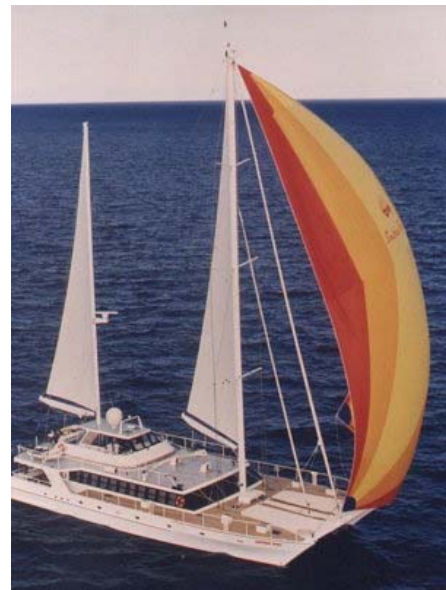
Design No. 96 – Sailing Cat