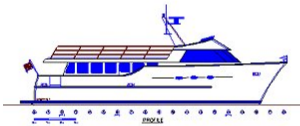
Design No. 386 - 60ft Power Catamaran

Interior arrangements vary from client to client. This type of vessel yields a high internal volume; allowing large master and guest bedrooms with ensuite bathrooms, open plan saloons with spacious galley, dining and lounge areas, transom garages for watertoys and tenders, hull compartments for a workshop and laundry, etc.