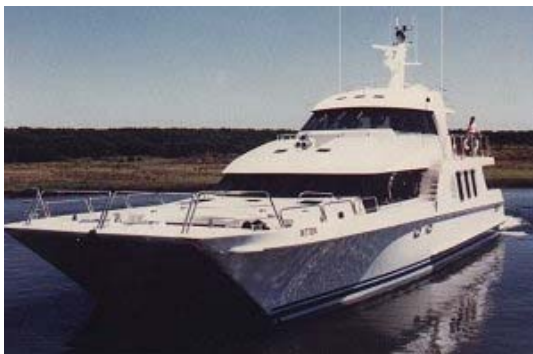
Design No. 161 - Luxury Motor Yacht