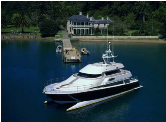
Designs from 16.5m to 85m