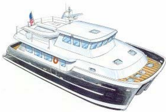
Design No. 350 - 45ft Power Catamaran

Power catamarans styled as trawlers are becoming increasingly popular among cruising yachtman, particularly in the United States. AluminumNow's Partners have been busy designing these vessels since 1998, with the latest launched in Canada (May 2000). Naturally the knowledge we have gained from designing vessels for the commercial and pleasure powerboat industry has been directly applied to our trawler catamarans.